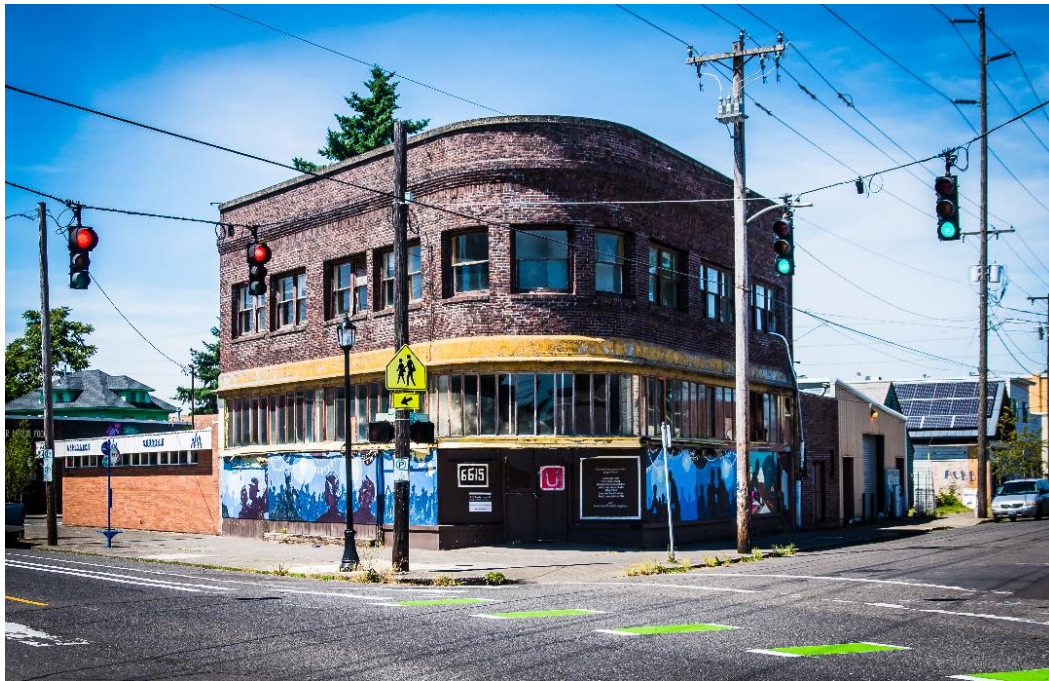
Current Condition of the Phoenix Pharmacy Building -June 2019