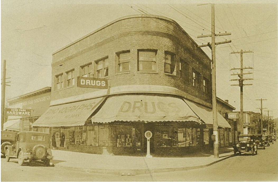
Early Phoenix Pharmacy Days 1920's

Spearheading the Restoration of the Historic Phoenix Pharmacy Building